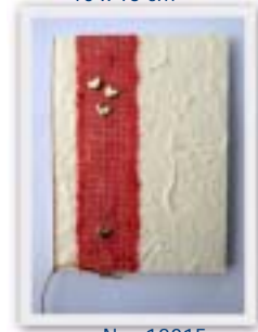
No. 12015 10 x 15 cm