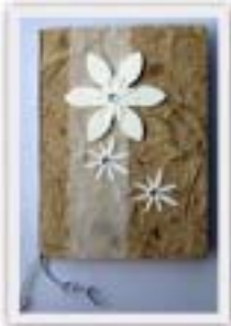
No. 12110 8 x 11 cm