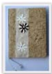
No. 12114 8 x 11 cm