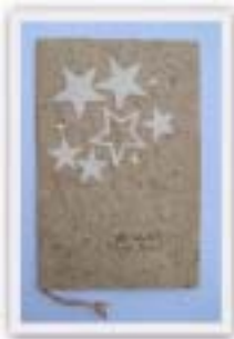
No. 12205 10 x 15 cm