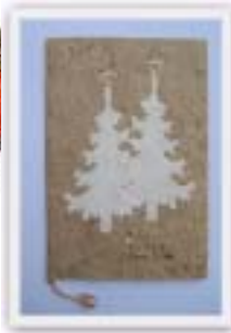
No. 12201 10 x 15 cm