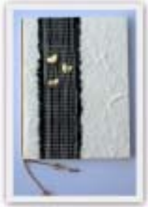
No. 12105 8 x 11 cm