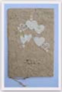
No. 12209 10 x 15 cm