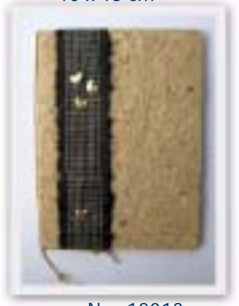
No. 12013 10 x 15 cm