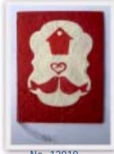
No. 12010 10 x 15 cm