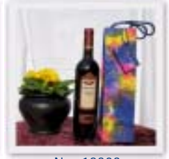
No. 12303 (33x9x9cm)