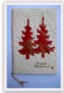
No. 12202 10 x 15 cm