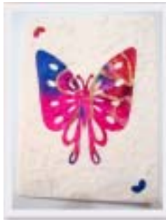
No. 12002 10 x 15 cm