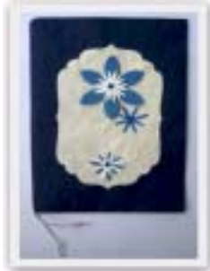
No. 12026 10 x 15 cm