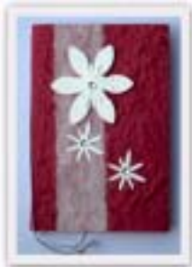
No. 12109 8 x 11 cm

Handmade cards of Thai SA-paper. All cards individual packed with envelope and neutral innercard.