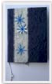
No. 12113 8 x 11 cm