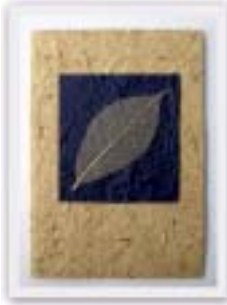
No. 12006 10 x 15 cm