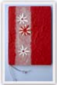
No. 12111 8 x 11 cm