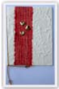
No. 12106 8 x 11 cm