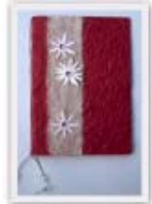
No. 12112 8 x 11 cm