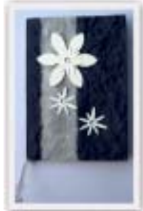
No. 12108 8 x 11 cm

Handmade cards of Thai SA-paper. All cards individual packed with envelope and neutral innercard.