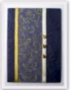
No. 12005 10 x 15 cm