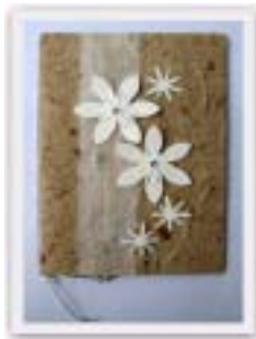
No. 12019 10 x 15 cm