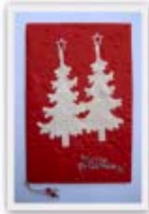
No. 12204 10 x 15 cm