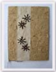
No. 12021 10 x 15 cm