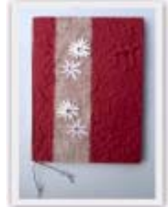
No. 12024 10 x 15 cm

Handmade cards of Thai SA-paper. All cards individual packed with envelope and neutral innercard.