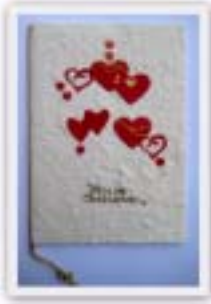
No. 12210 10 x 15 cm