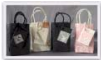
Gift bags (9x5,5x4cm) No. 12320 - black No. 12321 - white No. 12322 - pink