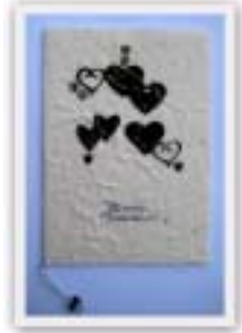
No. 12211 10 x 15 cm