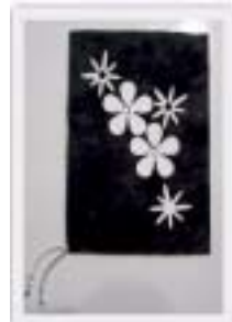
No. 12115 8 x 11 cm