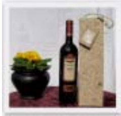
No. 12301 (33x9x9cm)