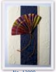
No. 12009 10 x 15 cm

Handmade cards of Thai SA-paper. All cards individual packed with envelope and neutral innercard.