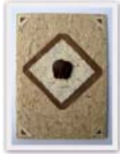
No. 12007 10 x 15 cm