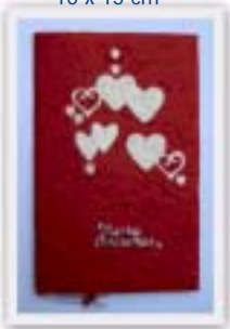
No. 12212 10 x 15 cm