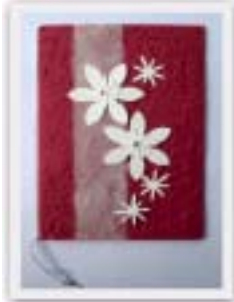
No. 12022 10 x 15 cm