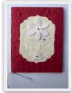
No. 12023 10 x 15 cm