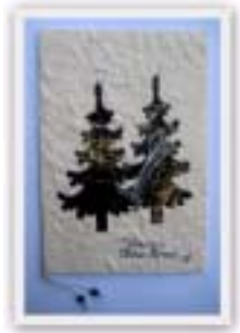
No. 12203 10 x 15 cm