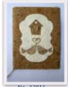
No. 12011 10 x 15 cm