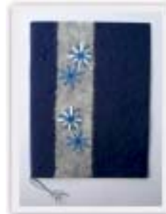
No. 12027 10 x 15 cm