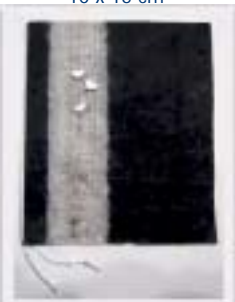
No. 12029 10 x 15 cm