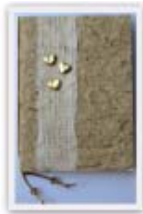
No. 12103 8 x 11 cm