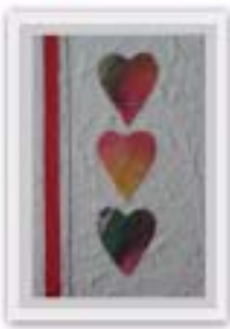
No. 12101 8 x 11 cm