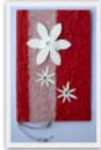
No. 12107 8 x 11 cm