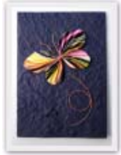
No. 12008 10 x 15 cm

Handmade cards of Thai SA-paper. All cards individual packed with envelope and neutral innercard.