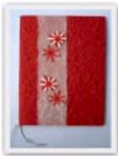
No. 12018 10 x 15 cm