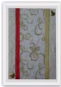
No. 12102 8 x 11 cm