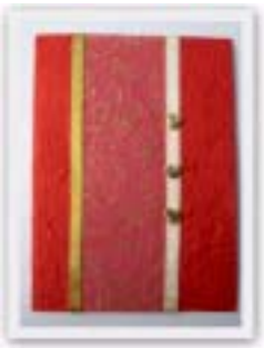
No. 12004 10 x 15 cm