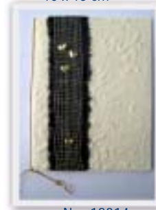
No. 12014 10 x 15 cm