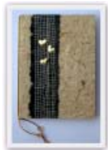
No. 12104 8 x 11 cm