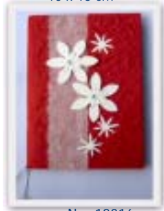
No. 12016 10 x 15 cm