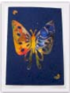
No. 12003 10 x 15 cm