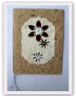
No. 12020 10 x 15 cm