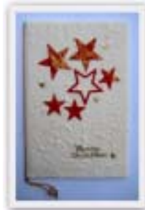
No. 12206 10 x 15 cm