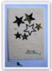
No. 12207 10 x 15 cm

Handmade cards of Thai SA-paper. All cards individual packed with envelope and neutral innercard.