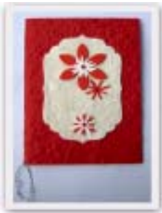
No. 12017 10 x 15 cm