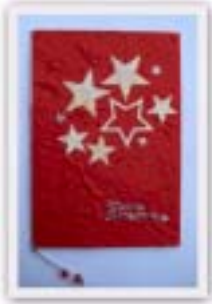
No. 12208 10 x 15 cm

Handmade cards of Thai SA-paper. All cards individual packed with envelope and neutral innercard.