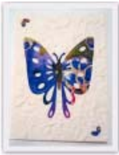
No. 12001 10 x 15 cm