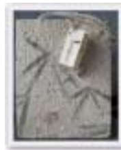
Gift bag (25x20x9,5cm) No. 12340