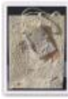
Gift bag (13x10x5cm) No. 12330