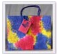
Gift bag (20x26x8cm) No. 12350