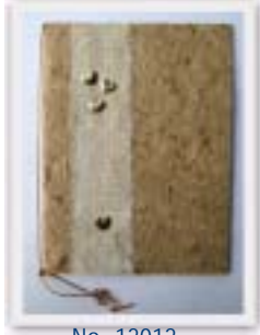
No. 12012 10 x 15 cm