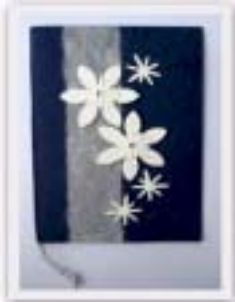
No. 12025 10 x 15 cm

Handmade cards of Thai SA-paper. All cards individual packed with envelope and neutral innercard.