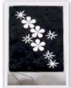
No. 12028 10 x 15 cm